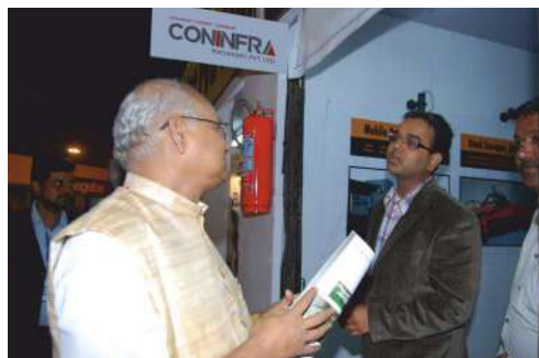
IRC Kolkatta 2008