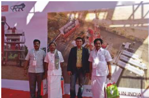
BC India 2016