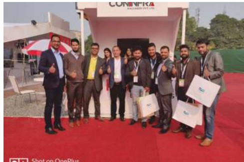
BC India 2018