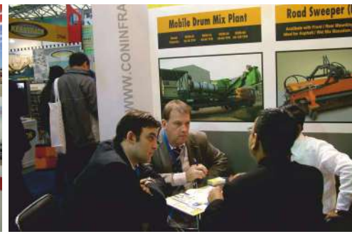
Bauma China 2008