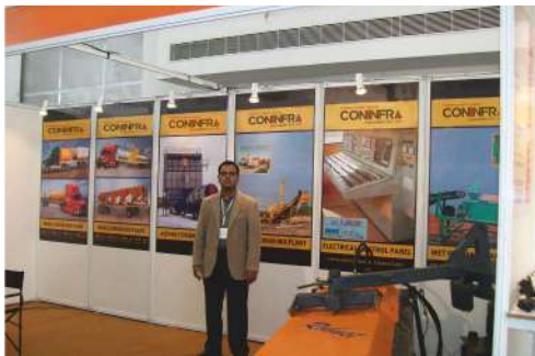
Commex Hyderabad 2010