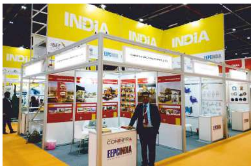
Big 5 Dubai 2016