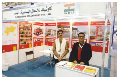
Saudi Arabia 2016