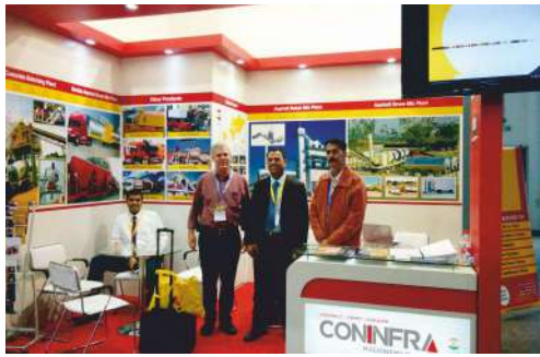
Bauma China 2014