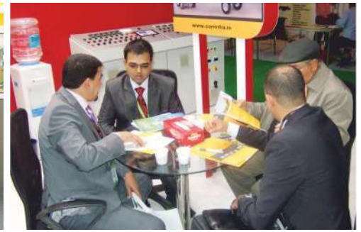
BC India 2011