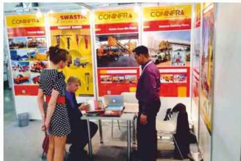
CTT Rusia 2014