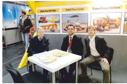
Bauma Germany 2010