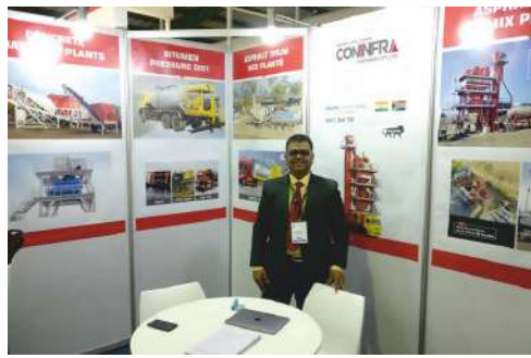
Bauma Africa 2018