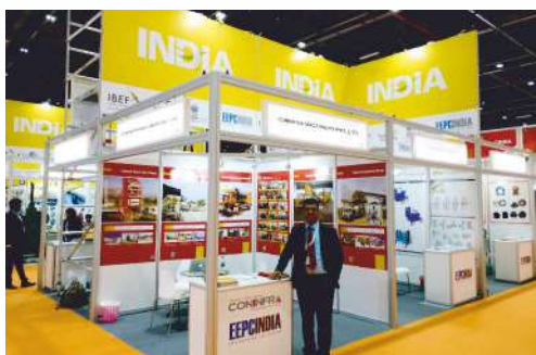
Big 5 Dubai 2016