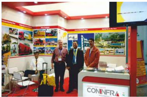
Bauma China 2014