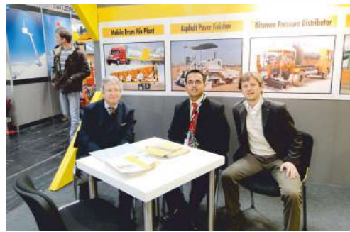
Bauma Germany 2010