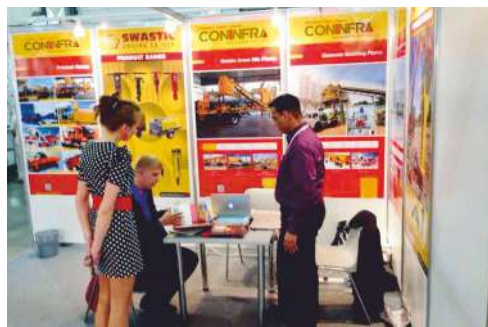
CTT Rusia 2014