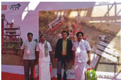
BC India 2016