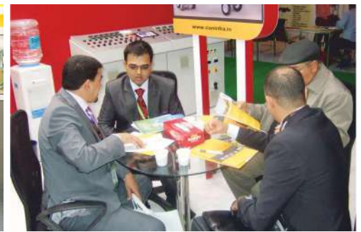
BC India 2011