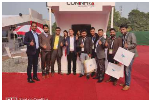
BC India 2018