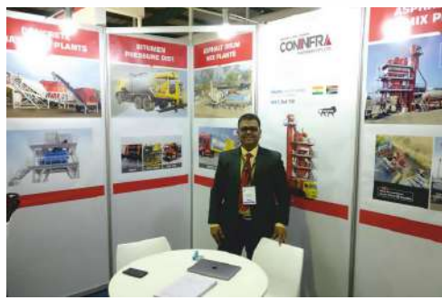
Bauma Africa 2018