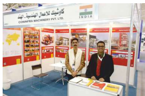
Saudi Arabia 2016