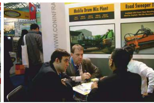
Bauma China 2008